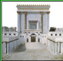
The Herodian Temple from the model of Jerusalem in the Second Temple Period.

The Intertestamental Period is also referred to as the Second Temple Period. Solomon's Temple was the first, while Ezra and Nehemiah's temple was the second (King Herod, The Great, added onto this Second Temple). The Herodian temple is the temple in which Jesus was dedicated to God by His parents. It was under Herod's son, Herod Antipater (Antipas) that Jesus was crucified. It was this temple that was destroyed in A.D. 70 by the Syrian/Roman armies.