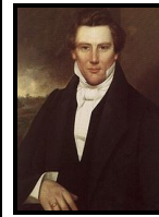
Left, Joseph Smith Jr., Father of LDS/Mormonism. Born 1805. First church est. 1830. LDS' worldwide membership in 2009 was 13,824,854, nearly 14 million. He presided over the Church until June 27,1844, when he was martyred.

The list of doctrinal problems offered in this article is far from complete, but hopefully it will bring discernment regarding the discrepancies between the Church of Jesus Christ of Latter- Day Saints and true Christianity. Mormons are now accepted by many Evangelicals, Roman Catholics, Baptists, etc., as brothers and sisters in Christ. []