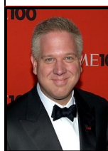
Glenn Beck left, is an avid Mormon leader who promotes ecumenism. He is a Radio/TV talk show host, politically conservative author and history buff. Please beware of his spiritual beliefs. He believes everyone serves the same God but in their own way. See more on Glenn Beck on pg. 6 []