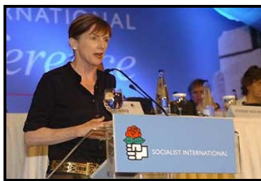
CAROL BROWNER SPEAKING AT SOCIALIST INTERNATIONAL MEETING.

reigns on earth during His Millennial Kingdom. Human government will always fail, as Jesus has shown us time and again. Unfortunately, President Obama has appointed to high places, many like minded people. Even when some of these appointees leave their posts, they continue working toward their socialist/communitic goals. []