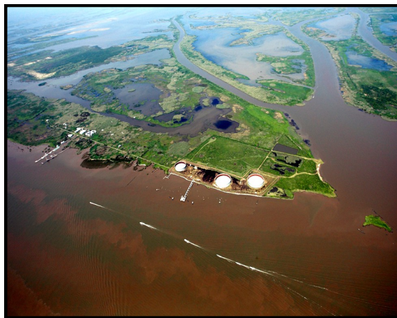
Typical dark red color of oil spill (Mississippi ) 1

prophesied. Christians are very aware of God’s hand upon their lives in even some of the smallest circumstances. But as far as being aware of signs of the times, God says, “The crane and the swallow observe the time of their coming, but my people know not the judgment of the Lord” (Jer. 8:7). To be discerning of the times, one needs to see God’s hand in everything.